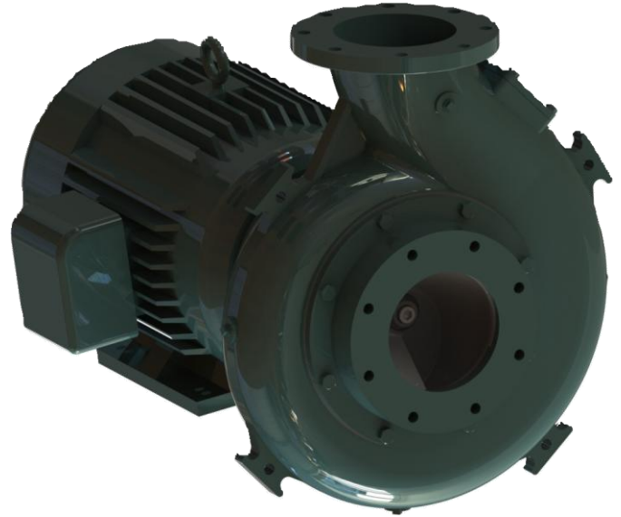
A typical picture of the pump is shown. Please contact InterTech Pump Company for further details. All information is approximate and for general guidance only.