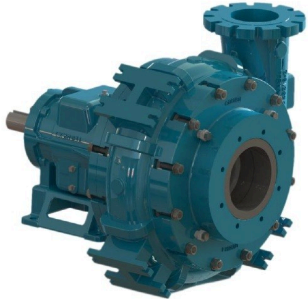
A typical picture of the pump is shown. Please contact InterTech Pump Company for further details. All information is approximate and for general guidance only.