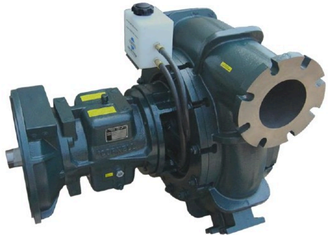
A typical picture of the pump is shown. Please contact InterTech Pump Company for further details. All information is approximate and for general guidance only.