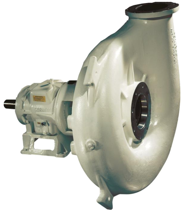
A typical picture of the pump is shown. Please contact InterTech Pump Company for further details. All information is approximate and for general guidance only.