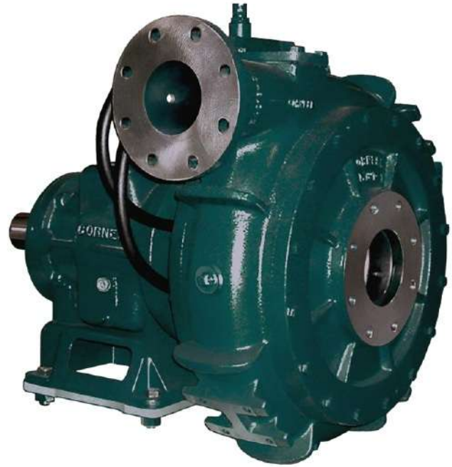
A typical picture of the pump is shown. Please contact InterTech Pump Company for further details. All information is approximate and for general guidance only.