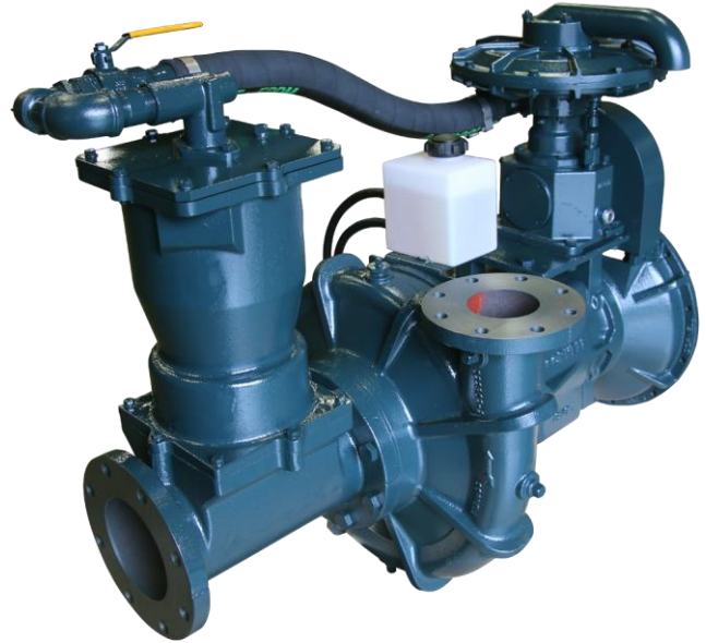
A typical picture of the pump is shown. Please contact InterTech Pump Company for further details. All information is approximate and for general guidance only.