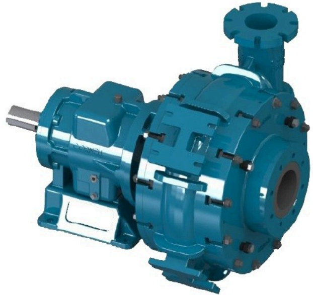
A typical picture of the pump is shown. Please contact InterTech Pump Company for further details. All information is approximate and for general guidance only.