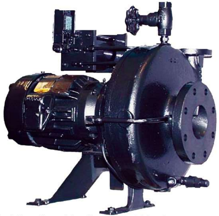
A typical picture of the pump is shown. Please contact InterTech Pump Company for further details. All information is approximate and for general guidance only.