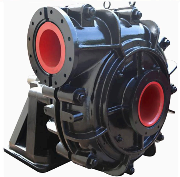
A typical picture of the pump is shown. Please contact InterTech Pump Company for further details. All information is approximate and for general guidance only.