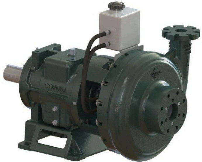
A typical picture of the pump is shown. Please contact InterTech Pump Company for further details. All information is approximate and for general guidance only.