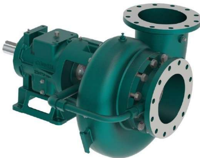
A typical picture of the pump is shown. Please contact InterTech Pump Company for further details. All information is approximate and for general guidance only.