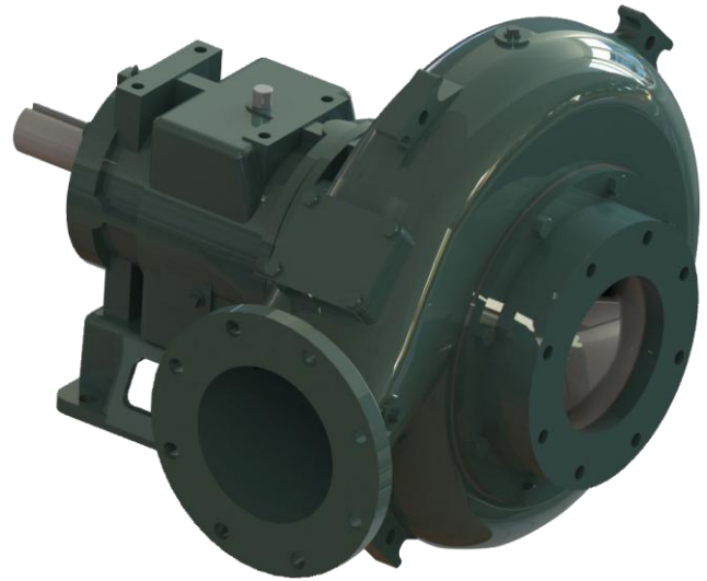
A typical picture of the pump is shown. Please contact InterTech Pump Company for further details. All information is approximate and for general guidance only.